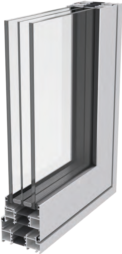
Option FLUSH DESIGN