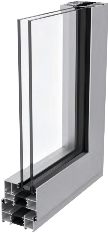
Option STANDARD DESIGN