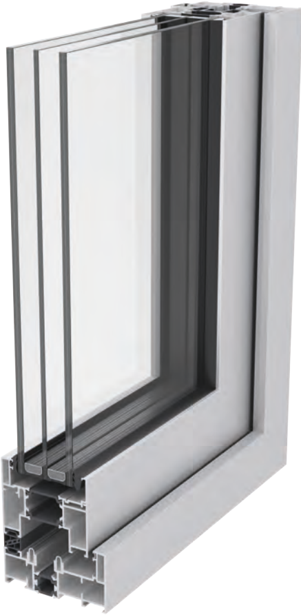
Option SQUARE DESIGN