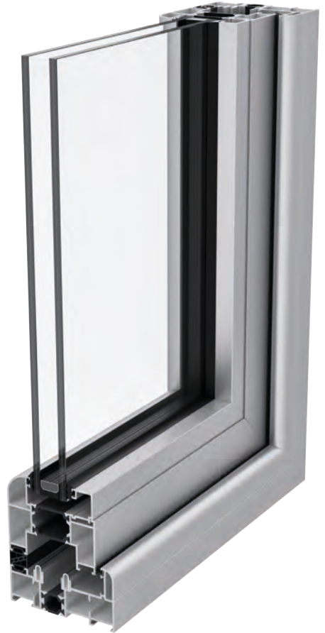
Option ROUNDED DESIGN